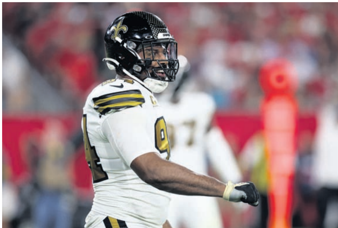
New Orleans Saints defensive end Cameron Jordan (94) reacts between plays in the first half of an NFL football game against the Tampa Bay Buccaneers in Tampa, Fla., Monday, Dec. 5, 2022.

That will make Arizona the first regulated sports betting state to host the big game since the U.S. Supreme Court struck down the federal ban on sports betting outside of Nevada, known